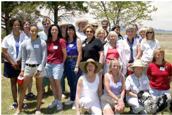
Current and former members gathered in 2004 to celebrate 25 Years of Networking.

Our Annual fall meeting and Technical Symposium provides an opportunity to present technical papers in a supportive environment. It also provides professional development and networking opportunities.