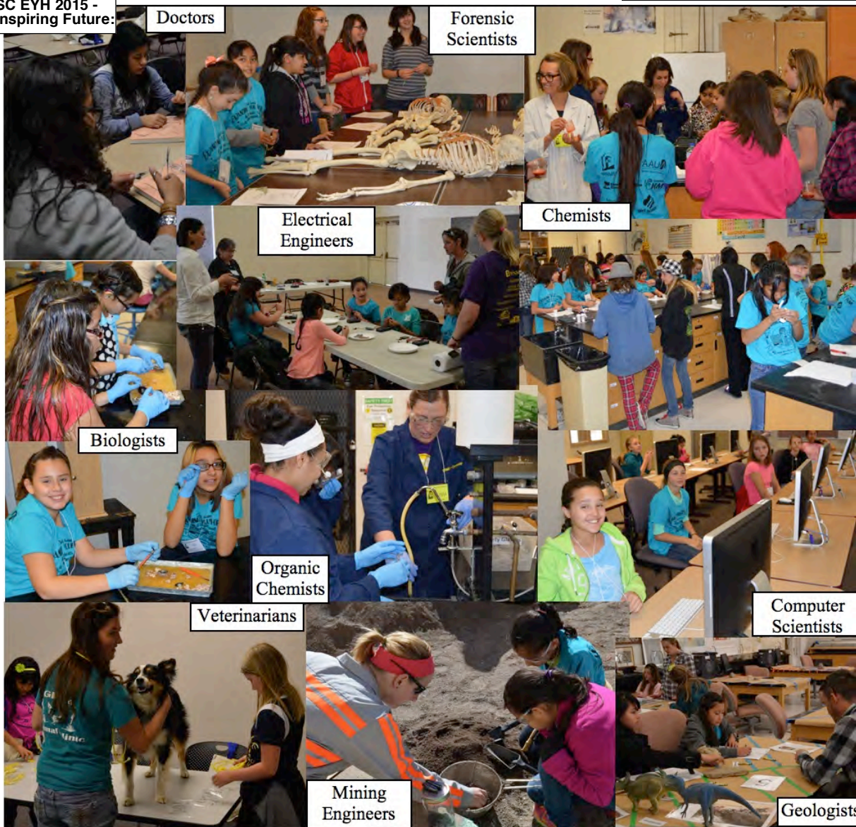
SC EYH 2015 - Inspiring Future: